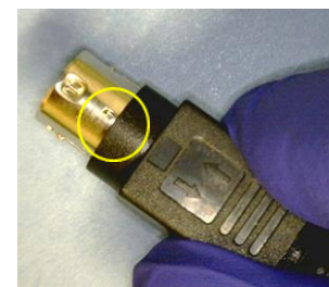
Retracted position for insertion and removal